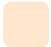
Georgia on my mind 134