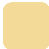
Yellow clover 375