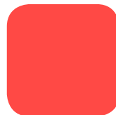
Soft glow 014